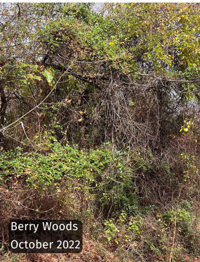
Berry Woods October 2022