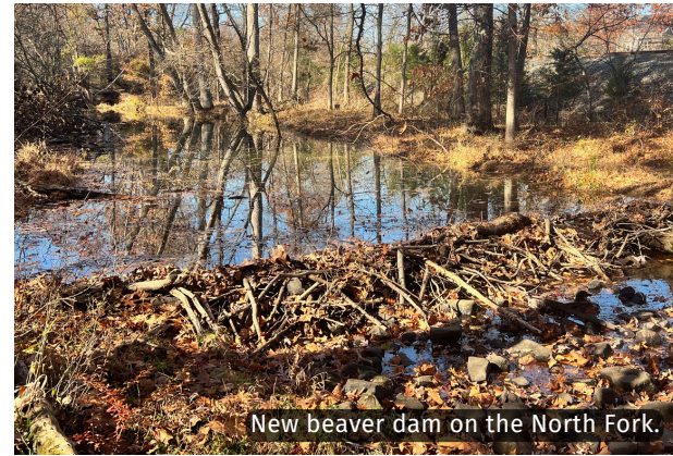
New beaver dam on the North Fork.

The second area of beaver activity isn't visible from any of our trails or observation areas. The secluded wetland sits in the northwest corner of the Preserve, tucked away in a low spot. Recent surveyors discovered large felled trees, multiple levels of dams, and new lodges in this area. Though they are rarely seen by visitors, we're happy to report that our beavers are thriving.