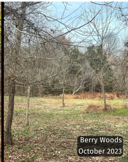
Berry Woods October 2023