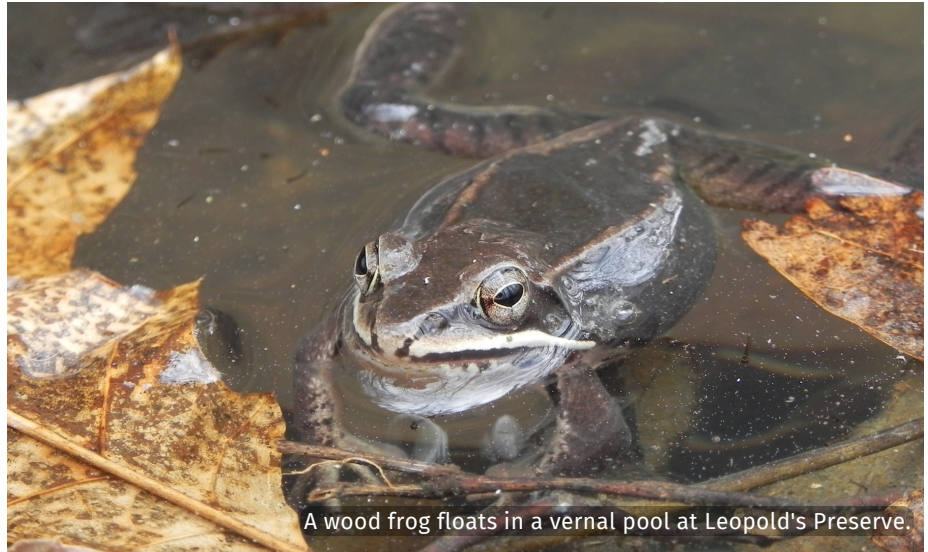
A wood frog floats in a vernal pool at Leopold's Preserve.

Work is well underway on this exciting project at Leopold's Preserve. We hope to convert a 2.25-acre former farm field into a representative oak-hickory savanna habitat, along with examples of many other native tree species. This will provide unique niches for native wildlife and will serve as an educational opportunity about the diversity of Piedmont tree species. This spring, we're putting the next steps of our plan into action; reducing ground cover, thinning out redcedars, and preparing to plant additional native trees in the fall. Watch this space as we continue making progress!