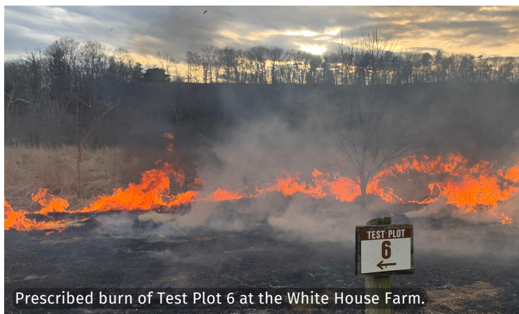
Prescribed burn of Test Plot 6 at the White House Farm.