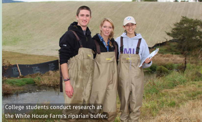
College students conduct research at the White House Farm's riparian buffer.