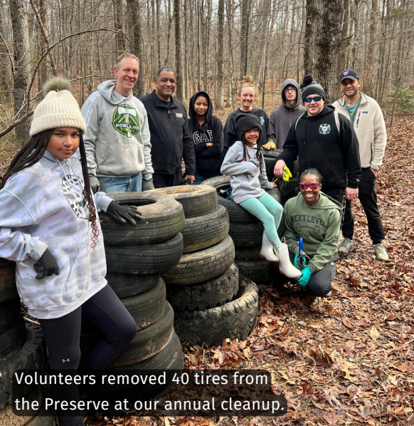
Volunteers removed 40 tires from the Preserve at our annual cleanup.

Thanks to the hard work of our dedicated volunteers, we removed 4.5 tons of legacy trash from the Preserve during our latest cleanup! After three years of cleanups, our team has assessed that we have eliminated the majority of legacy trash dumps on the property. In the future, we don't anticipate hosting any more trash cleanups on this scale. What an achievement!