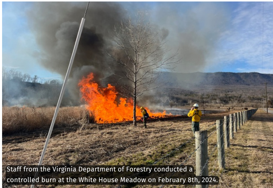
Staff from the Virginia Department of Forestry conducted a controlled burn at the White House Meadow on February 8th, 2024.