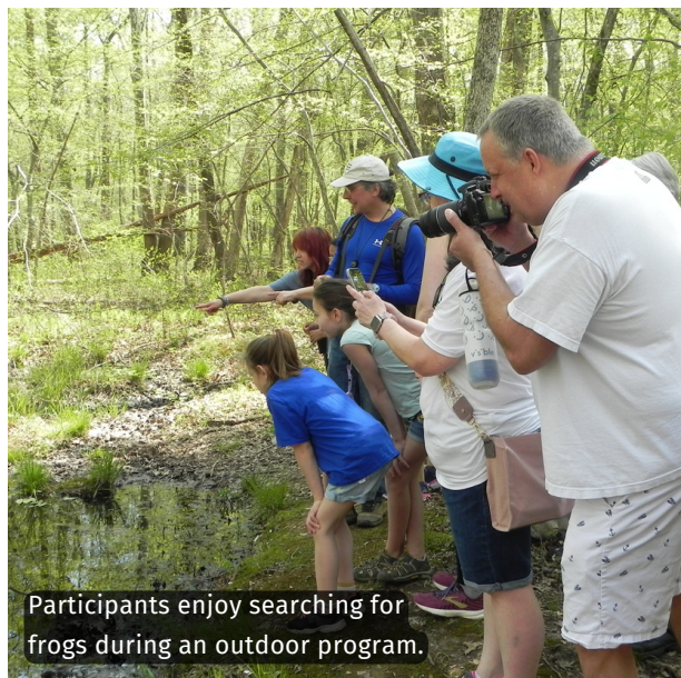
Participants enjoy searching for frogs during an outdoor program.

Though the Lecture Series has concluded, we are still offering programs on the first Wednesday of each month! Join us at Leopold's Preserve for "Hike with a Naturalist", the monthly guided hike series led by our friends at the Bull Run Mountains Conservancy. This popular series offers a chance for informal learning while enjoying a casual stroll along our trails.